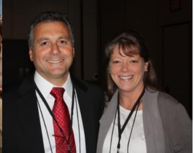
Univ. of Florida Reception