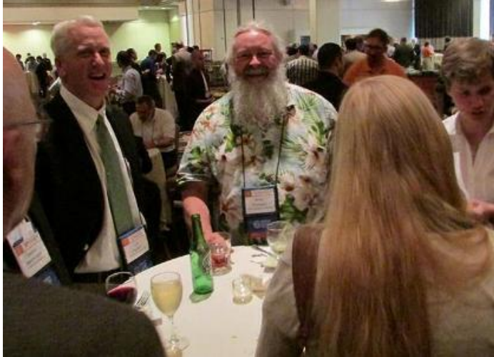
Networking at the President's Reception