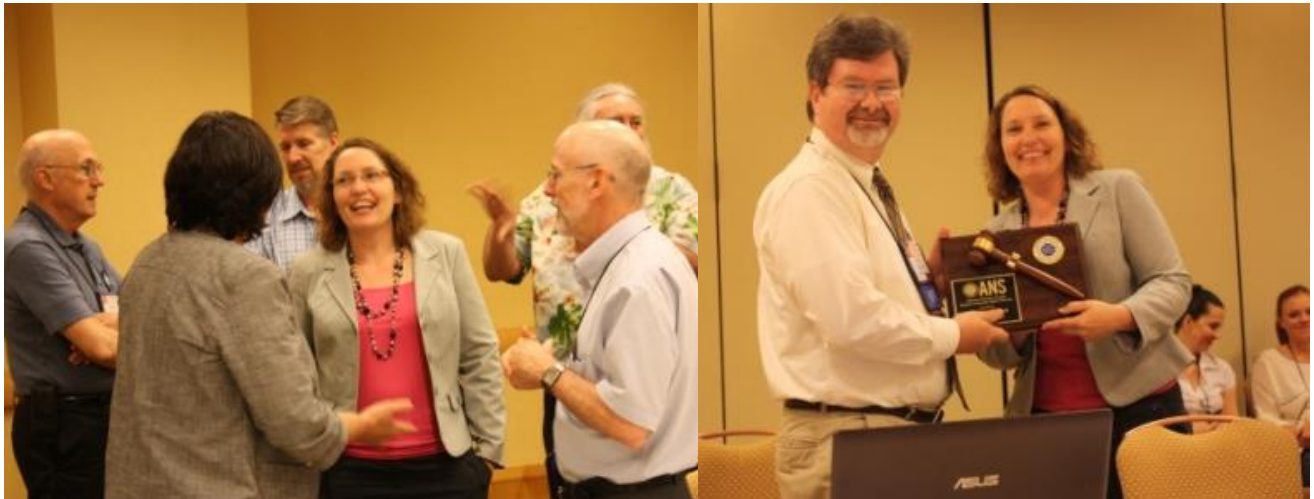
Governance Meeting on Sunday

There were three sessions at the Atlanta meeting: Data Analysis in Nuclear Criticality Safety-I, Data Analysis in Nuclear Criticality Safety-II, and Nuclear Criticality Safety Standards-Forum. There were 14 papers in the Data Analysis in Nuclear Criticality Safety sessions. The presentations given in Atlanta are available in the NCSD website at http://ncsd.ans.org/site/papers_Atlanta_Summer2013.html .