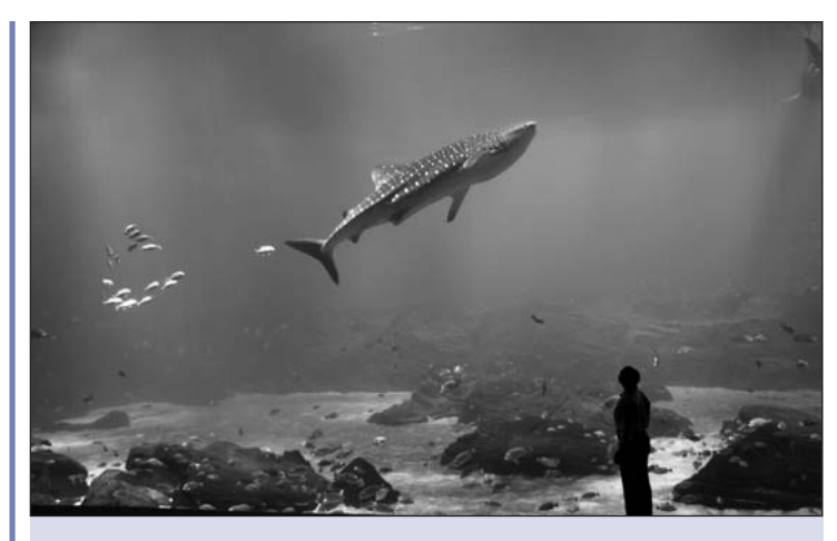
In the Ocean Voyager gallery at the Georgia Aquarium, you will find the largest aquarium viewing window in North America.

Tickets can be purchased at the ANS Registration Desk for $50.