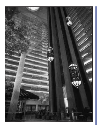
Hyatt Regency Atlanta Hotel