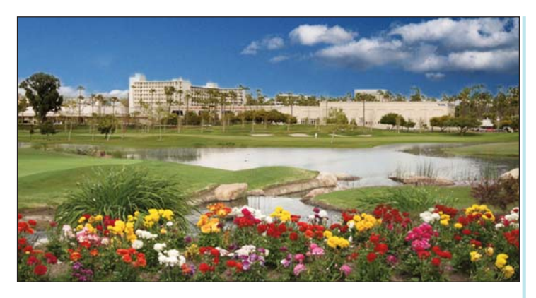
Town and Country Resort— The Resort from the Riverwalk Golf Club.