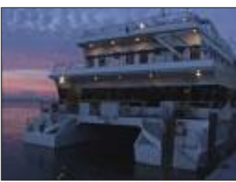
Reception and Dinner on the Biscayne Lady Yacht