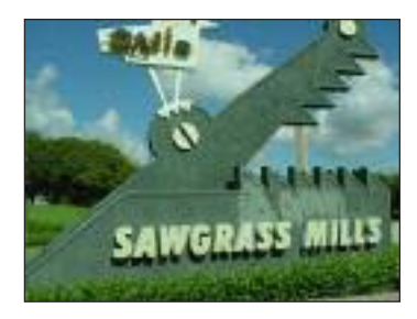
Shopping at Sawgrass Mills Page 7