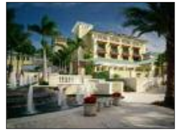
Reception and Dinner at the Diplomat Country Club Page 7