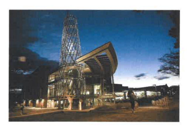
"#1 Online Master of Nuclear Engineering in 2018" - Best College Reviews

"#3 Nuclear Engineering Graduate Program in 2019" - US News and World Report